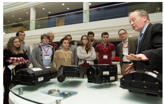
MIGSAA students learning about maths to machinery