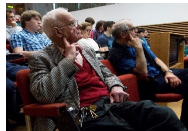
A captivated audience enjoys the afternoon's arrangements!